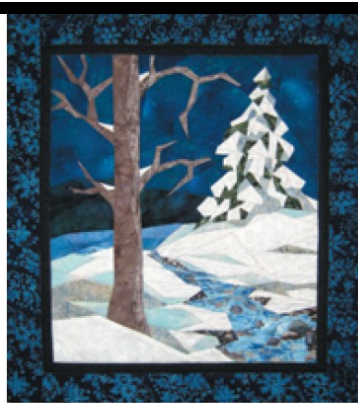
17" X 19" Season's End