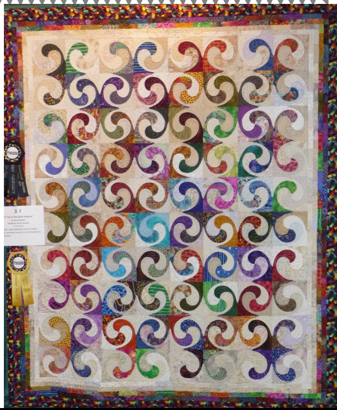
A sample of the finished October workshop project